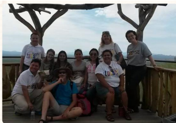
Dios Es Amor "Family Portrait"