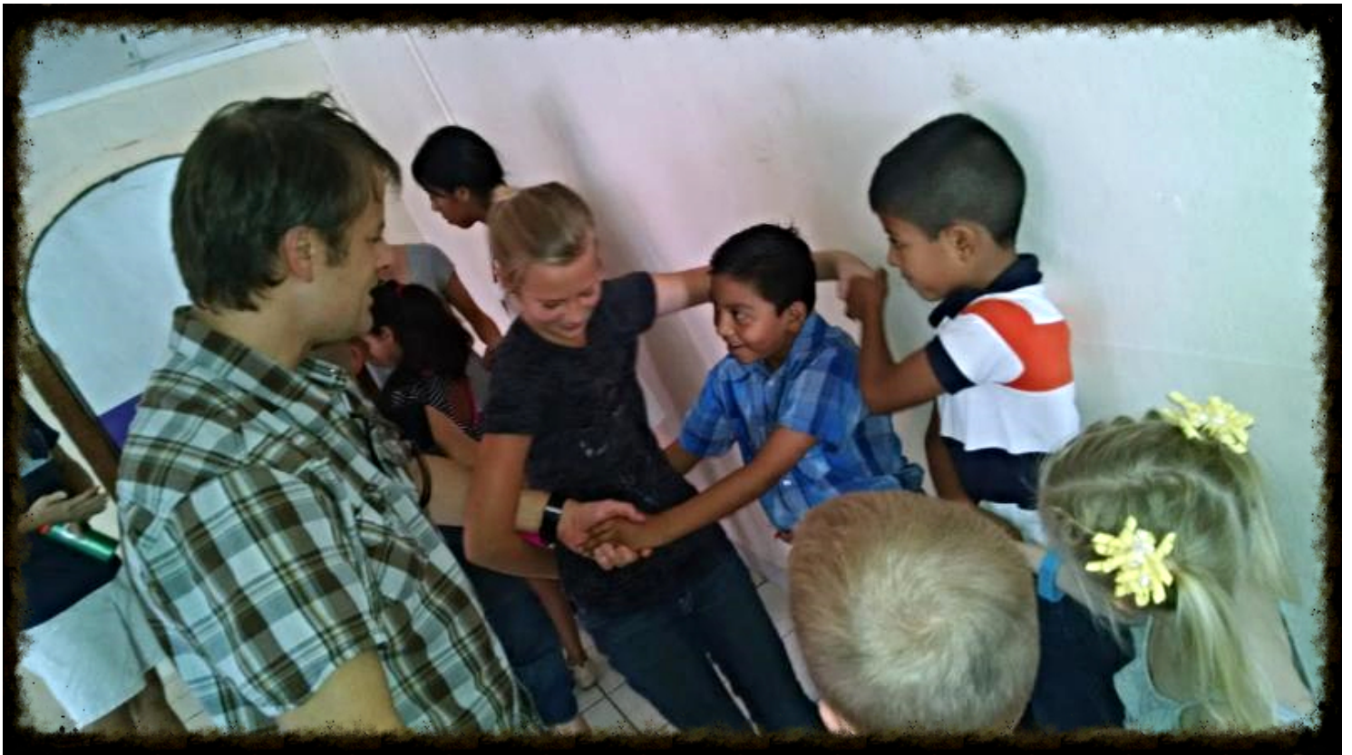
Lirio de los Valles and Immanuel participating in Bible School Together.