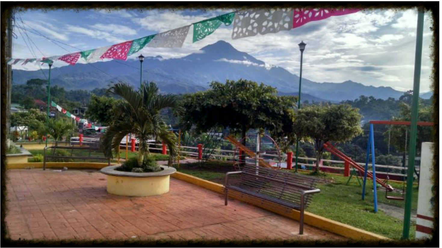
View of Volcano Tacana from Salvador Urbina, Chiapas