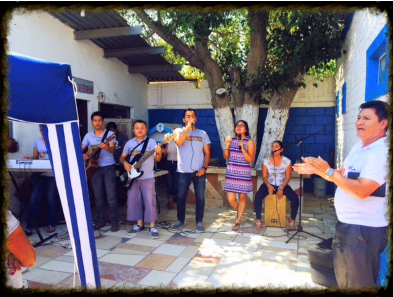
Dios Con Nosotros Leading Singing at CRREDA

"They asked each other 'Were not our hearts burning within us while he talked with us on the road and opened the Scriptures to us?' --Luke 24:32